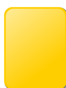
Yellow Card Reflection