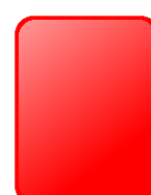
Red Card Reflection

We understand that everyone can make mistakes and sometimes present the wrong behaviours. Due to this, this process is a two-way system so children can earn back their chance to be on a green card by the end of the day by choosing to change their behaviour and instead follow the school rules.